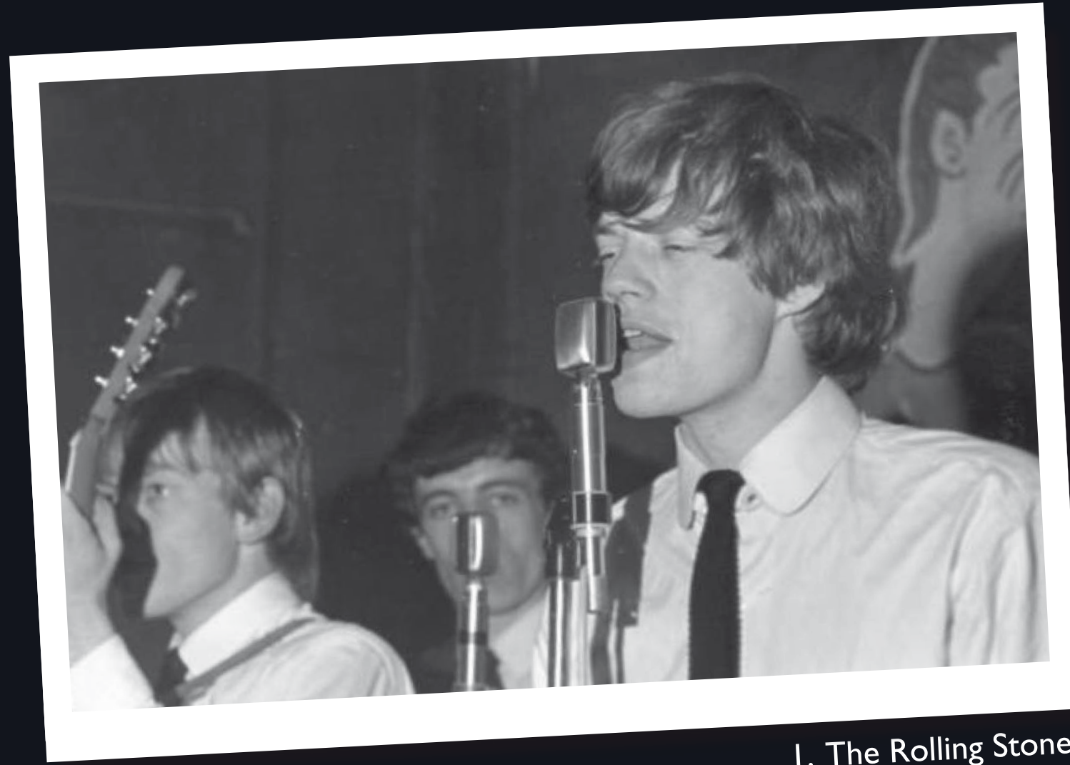
1. The Rolling Stones

In the early 1960s across the river, Eel Pie Island reeled and rocked to the sounds of rhythm and blues, the south of England's answer to Merseybeat. Here, the Eel Pie Island Hotel played host to artists like The Rolling Stones, The Who, Eric Clapton, Jeff Beck, Jimmy Page, Rod Stewart, David Bowie (then David Jones), Pink Floyd and many other fledgling performers who would go on to become internationally renowned superstars of the music world.