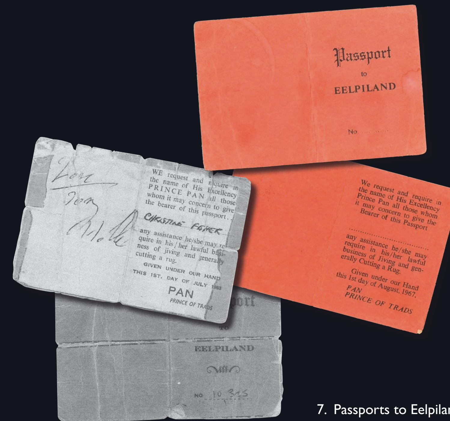
7. Passports to Eelpiland

Following the success of The Stones, the Eel Pie Island Hotel featured dozens of new acts, some of whom would become world famous and others who could look back and revel in having been part of the phenomenon which proved to have such a lasting influence on music and fashion both in Britain and internationally.