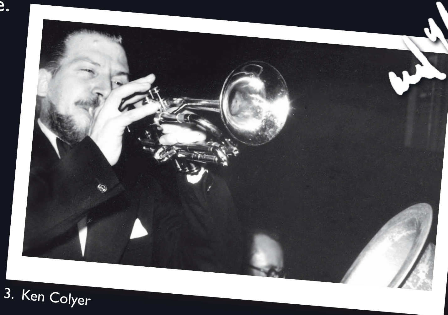
3. Ken Colyer

In 1956 it was adopted as a jazz venue, featuring the popular trad jazz acts of the time, such as Ken Colyer, Acker Bilk, Kenny Ball, George Melly and many more.