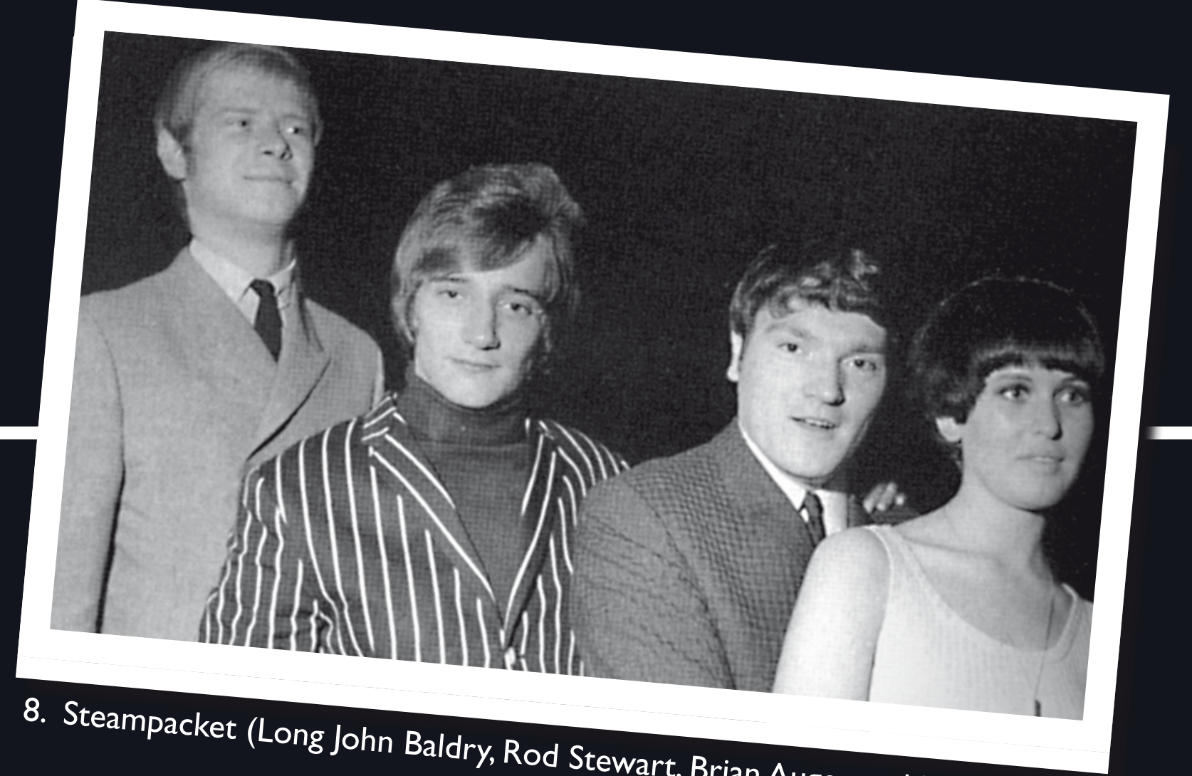
8. Steampacket (Long John Baldry, Rod Stewart, Brian Auger and Julie Driscoll)

The Eel Pie Island Hotel rapidly became 'the' place to hear rhythm and blues bands in the west side of London. One peculiarity of the club which is fondly remembered by regulars was the sprung dance floor, which acted like a trampoline, causing the audience to bounce up and down in front of the somewhat dilapidated stage, all adding to the excitement.