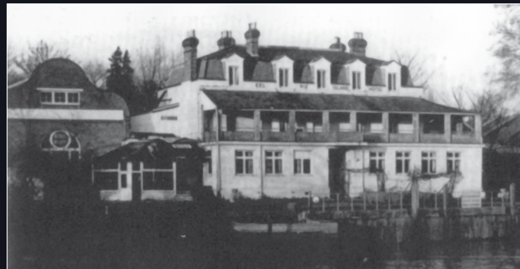
2. The Eel Pie Island Hotel

In the early 1960s across the river, Eel Pie Island reeled and rocked to the sounds of rhythm and blues, the south of England's answer to Merseybeat. Here, the Eel Pie Island Hotel played host to artists like The Rolling Stones, The Who, Eric Clapton, Jeff Beck, Jimmy Page, Rod Stewart, David Bowie (then David Jones), Pink Floyd and many other fledgling performers who would go on to become internationally renowned superstars of the music world.